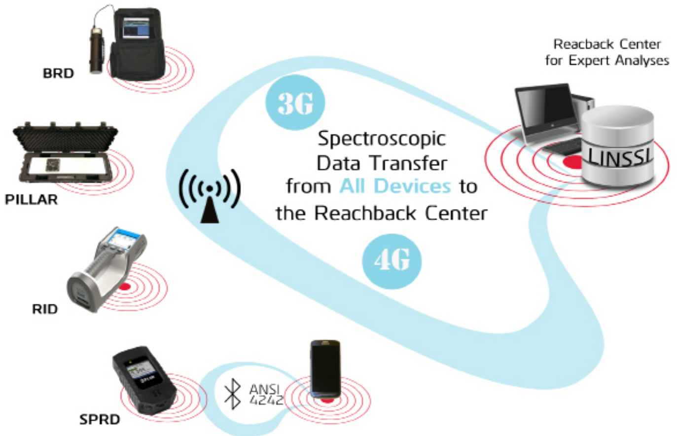
Picture 1. Data Transfer Solution

Finnish Radiation and Nuclear Safety Authority, STUK, has signed four years framework contract with Environics for radiation detection equipment program. This program will significantly improve Finnish nuclear security architecture.